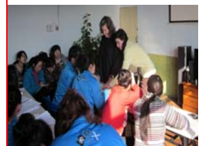
Above: Onsite training

***Because our videos have been reposted to numerous websites, it is difficult to calculate an exact number, but from the "hits" that are available to us, the number easily surpasses 10,000.