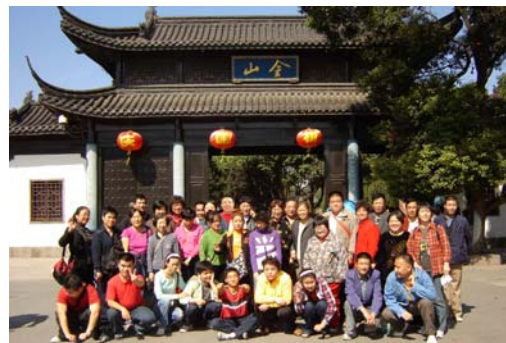
Right: First long distance trip organized by and for support group members