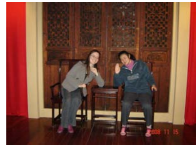
Above: Volunteer peer mentor enjoys friendship with support group member

these exciting accomplishments, success to FIVE is measured in individuals' stories as well. A recent group trip to Shandong Province allowed a family of three to, for the first time in their lives, take a long-distance trip and stay overnight in a hotel. Having faced much discrimination due to disability, they have found a new "family" in The Five Project. The father of this family has taken a leadership role in the group and volunteers frequently for this group and other FIVE activities.