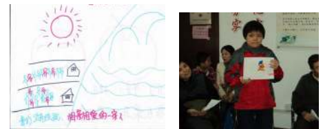
Above: "No discrimination. We are a loving family" (mother of teenager with autism)

adults with disabilities. Here we share some of their work, and their explanations.