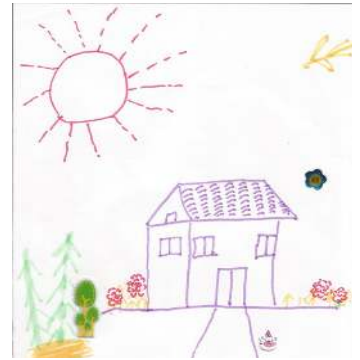
A warm family: Support group participant drawing (see p. 2)

In your annual giving at the end of the year, please consider supporting our work, so that more families of individuals with disabilities can receive support and education that they urgently need. (Donate online at www.thefiveproject.org or send a donation to 33 Fitch Terrace, Randolph, MA 02368)